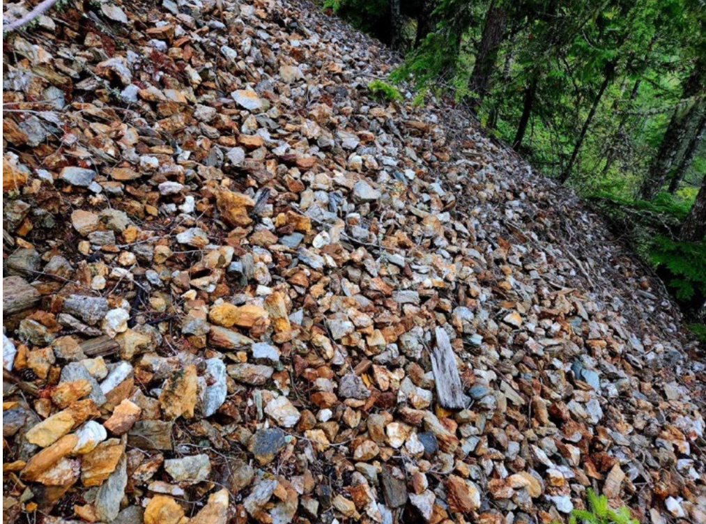
Figure 3. More waste rock