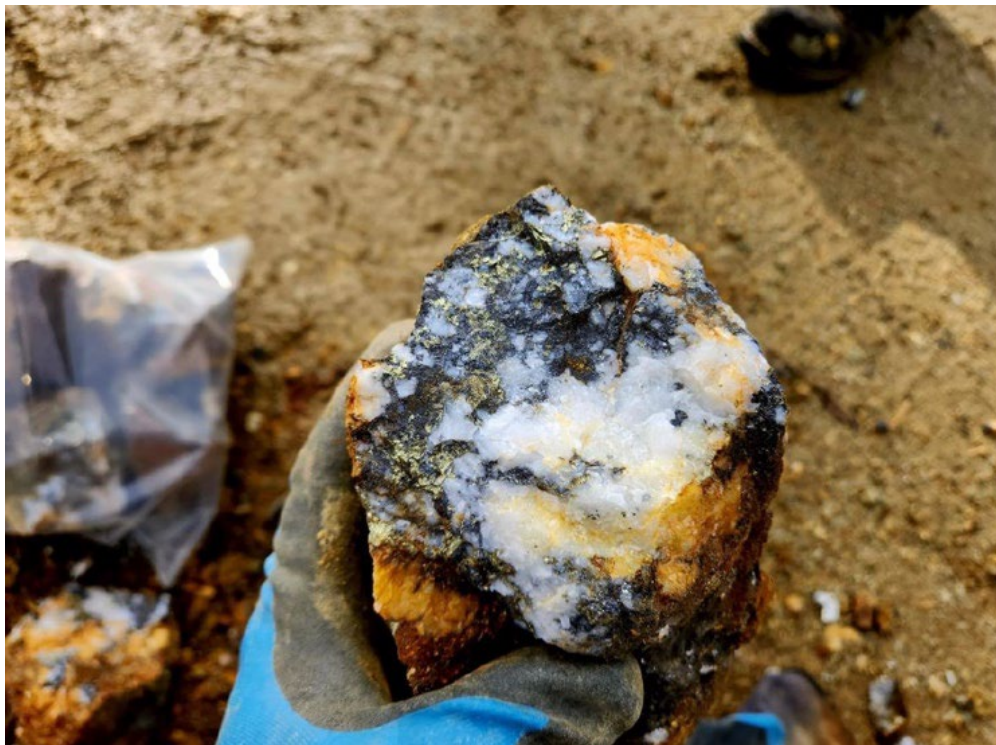
Figure 4. Chip from a 200 lbs mineralized boulder encountered while waste rock sampling