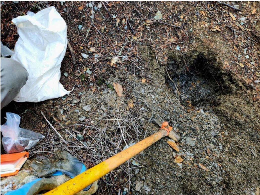
Figure 2. Sample bag collected from waste rock pile