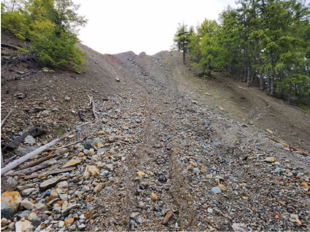
Figure 1. Waste rock pile at Mount Sicker (one of many)